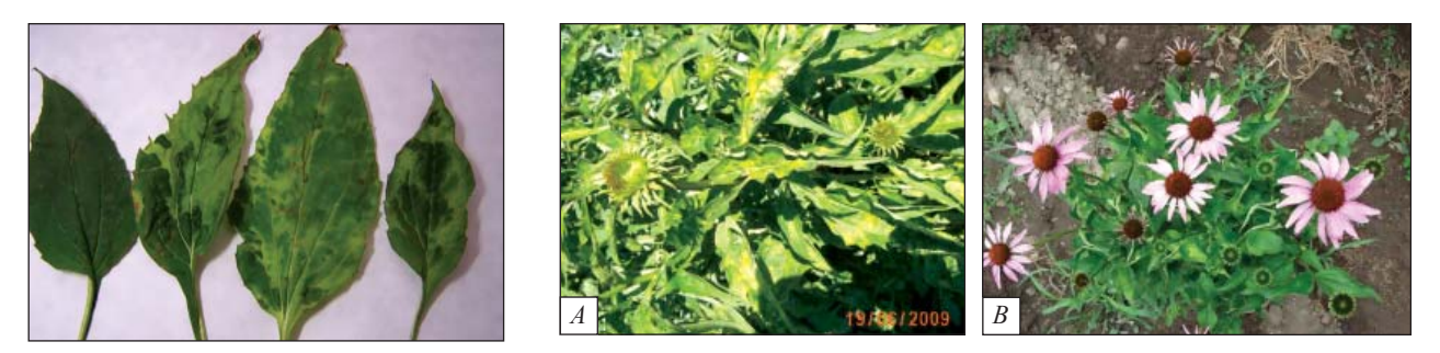
Fig. 1. Symptoms of mosaics on Echinacea purpurea leaves caused by Cucumber mosaic virus in Bulgaria (at the left – a symptomless leaf) [4] Fig. 2. E. purpurea infected by CMV, AMV and TMV in Bulgaria: A — spotting on the leaves; B — dwarfed leaves and stunting [4]