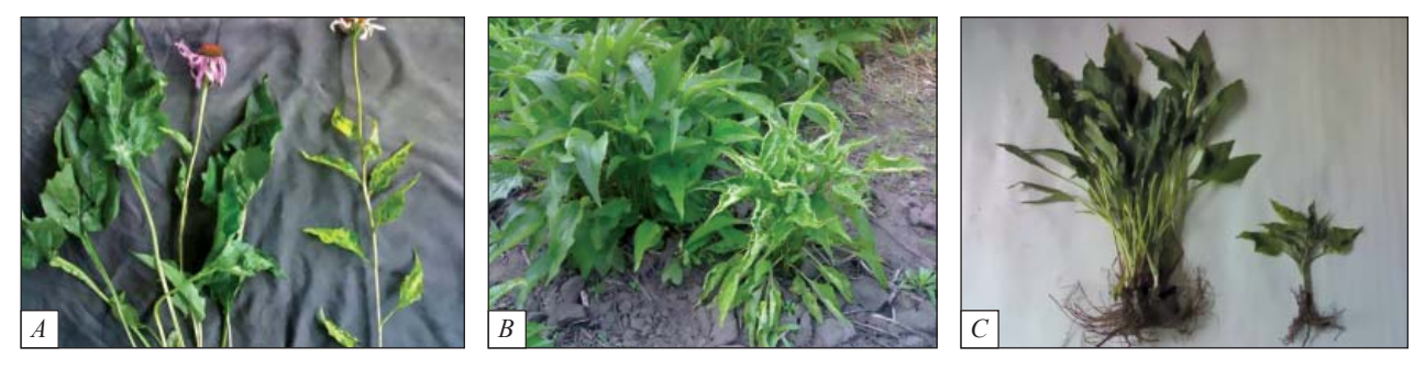
Fig. 3. Echinacea purpurea infected by CMV in Ukraine: on each photo at the left – healthy plant, at the right – virus infected plant [17, 33]