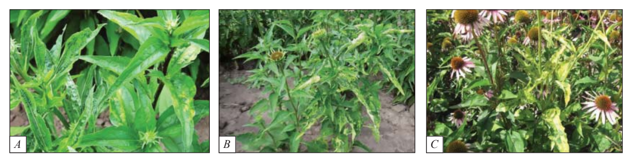
Fig. 4. Symptoms of TSWV infection on purple coneflower in Ukraine: A, B – phase of budding-initial blossoming; C – end of blossoming [19, 24, 61]

other symptoms – spotting and dwarfed coneflower leaves (Fig. 2).